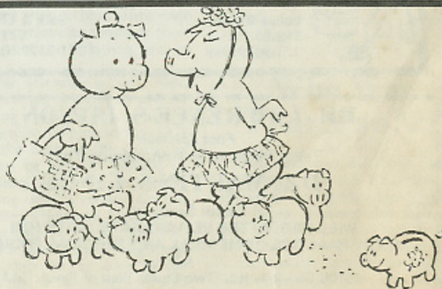
"That little pig went to the Propagation of the Faith on Mission Sunday."